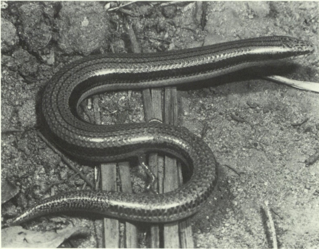
Figure 4 Holotype of Lerista griffini photographed in life by Philip Griffin.