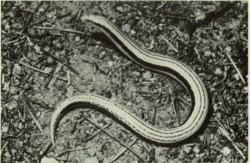
Figure 1 Holotype of Lerista picturata edwardsae photographed in life by Gregory Harold.

Upper surface pale brownish-grey (silvery-grey in life, at least in holotype) to greyish-brown. Two blackish dorsal lines from neck to tip of tail, each passing through a series of paravertebral scales; occasionally outside of these a series of blackish dorsal spots which rarely (3% of specimens) coalesce to form an additional pair of lines. Head variably marked with blackish, most markings taking form of a thick discontinuous margin to scales. Wide blackish upper lateral stripe from nasal to end of tail. Posterior edge of upper labials thickly margined with blackish-brown. Lower labials sometimes brown-